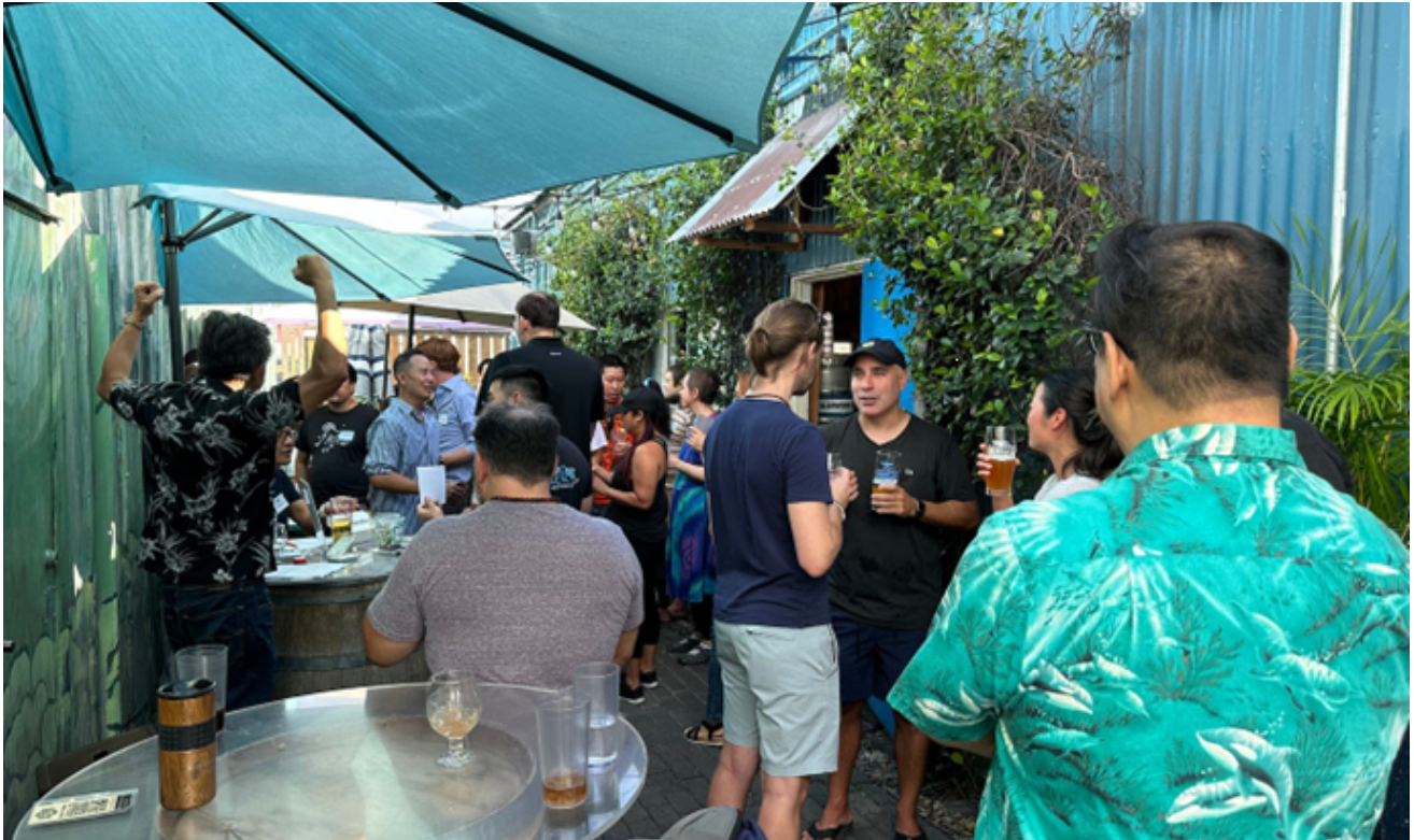
Pictured: ThriveHI members at our Remote Work Pau Hana