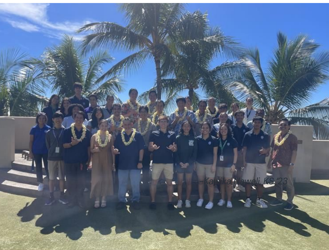
Pictured: Talk Story with Tech Professionals – KS Kapalama

In 2023, we partnered with Kamehameha Schools Kapalama and UH PACE to host Talk Story with Tech Pros for the second year. Across both events, we were able to connect over 500 students with tech professionals from a variety of concentrations including venture capital, information technology, and software engineering.