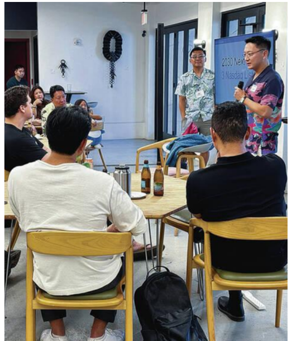
Pictured: Participants at our Next Round Pitch Karaoke event

“ThriveHI is an inclusive org and celebrates diversity in every aspect. They host events that encourage individuals of all backgrounds and experience levels to engage within the community. Thanks to the pitch event, I had the opportunity to connect with a co-founder and work on an exciting project together. I'm thankful that I've been part of the community and I hope more people can join us!”